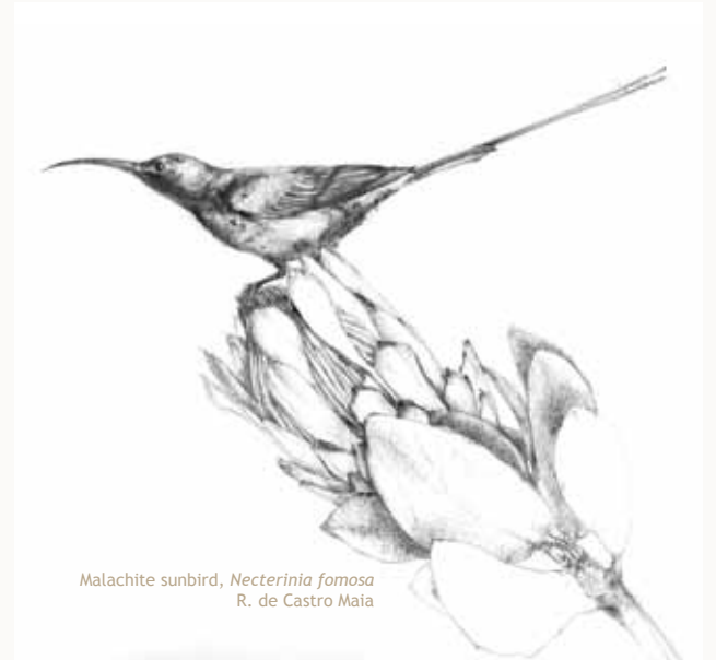
Malachite sunbird, Nectarinia fomosa

Let Gondwana's breathtaking beauty stir your senses and restore your spirit as you experience nature's creatures amidst undulating valleys and dramatic mountain vistas.