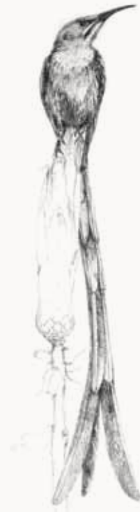
Cape Sugar Bird, Promerops cafer R. de Castro Maia

A modern and luxurious twist on the traditional Khoi-San dwelling. Each open plan suite is nestled into its spectacular surrounds with 180-degree views, sky lights for star gazing, clay pot fireplaces and deep baths to keep you warm upon return from an evening game drive.