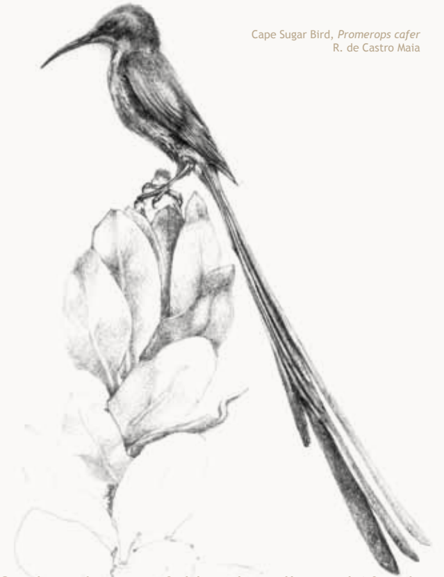
Cape Sugar Bird, Promerops cafer R. de Castro Maia

Gondwana's expert field guides will reveal Africa's wildlife to you in a Cape Fynbos environment; a truly unique safari experience! Exhilarating encounters on drive, on horseback or on foot with Big 5 game and our endangered species like the Cheetah, Cape Mountain Zebra, and Black Rhinoceros will give you lasting memories.