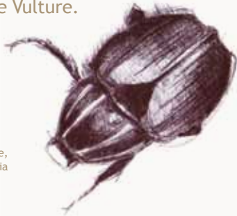
Cape scarab beetle, R. de Castro Maia

We are passionate about utilizing Gondwana's habitat to contribute to the conservation of endangered wildlife species and have re-introduced the Desert Black Rhino to the Southern Cape, a first for the last Century as well as the endangered Cape Mountain Zebra, Cheetah, Bontebok and Cape Vulture.